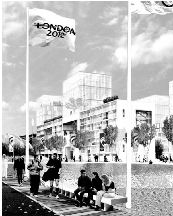
An artist's impression of the Olympic village in Stratford from the 2005 Olympic bid. The 1960s revival flavour is very refreshing and the 'bubblegum swastika' logo had yet to be introduced.

These all add up to thousands of small and larger events and cultural programmes which have the power to attract visitors and engage the nation and overseas visitors in travel and eating out on a massive scale. On a more local level, they are supplemented by hundreds of 'Inspire Mark' cultural community projects, and many hospitality operators will want to be involved in these either as part of their 'corporate social responsibility' efforts in 2012, or for other promotional reasons.